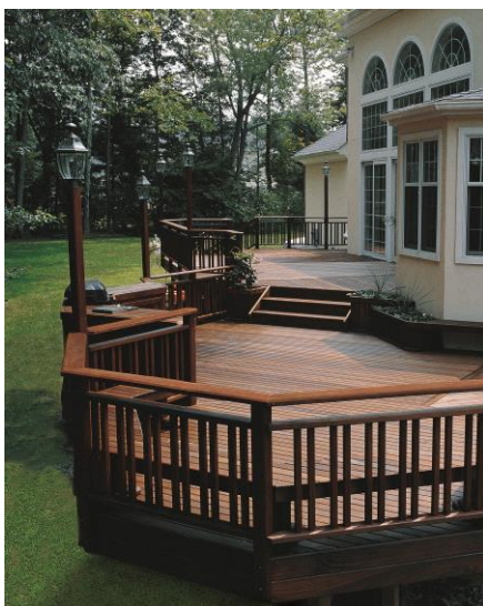
Example -Oiled Wood