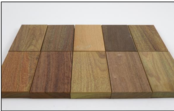
Example - Ipe Color and Grain Variation

Color and Grain Variation is typical of materials created by nature and recognized as part of the beauty that sets natural products apart from manufactured products. This is particularly true where wood products are concerned though some species have more or less color variation than others. This should always be considered when looking at wood samples as Iron Woods are supplied mixed grain and are not sorted for color. Some consistency in color can be achieved through either staining wood or allowing wood to weather or grey out naturally.