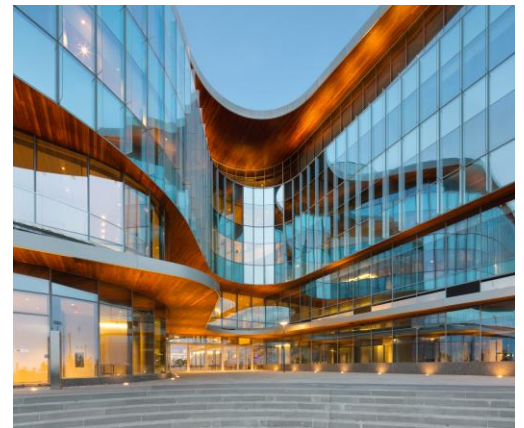
Ipe Soffit After Oil Application