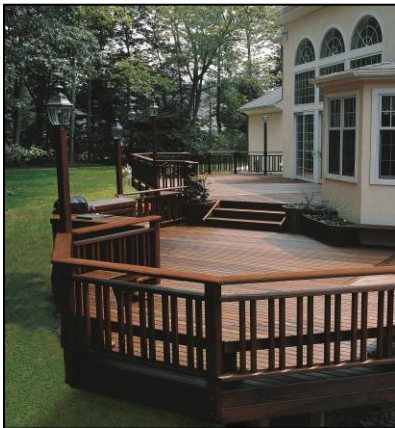
Ipe After Oil Application

A first coat on all faces prior to installation with an oil or water based finish is not necessary but recommended even if you intend to let the deck weather. Application of even an inexpensive oil based finish slows moisture absorption and release during seasonal moisture transitions, reduces surface checking and improves stability during the initial acclimation process. This can significantly improve project outcome if you are installing air dried decking in arid dry conditions and direct sunlight. It is important to remember that you can apply water based finishes over oil based finishes but you cannot apply oil based finishes over water based finishes so make sure you take this into consideration when selecting finishes.