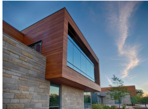
Garapa Rain Screen With Oil Finish