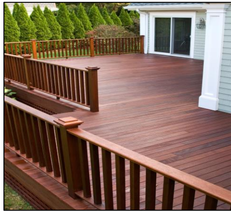
Red Balau After Oil Application