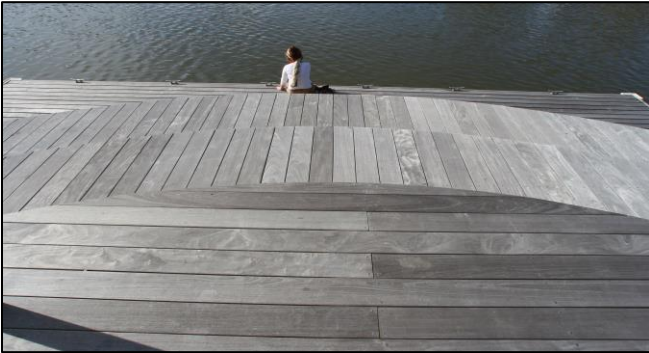
Ipe After Weathering