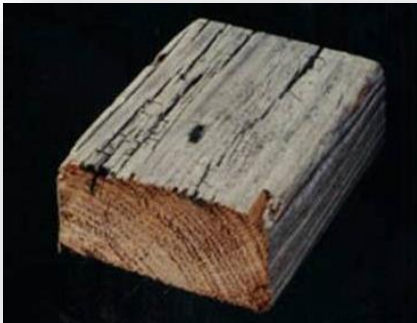
Treated Pine 5 Years Atlantic City